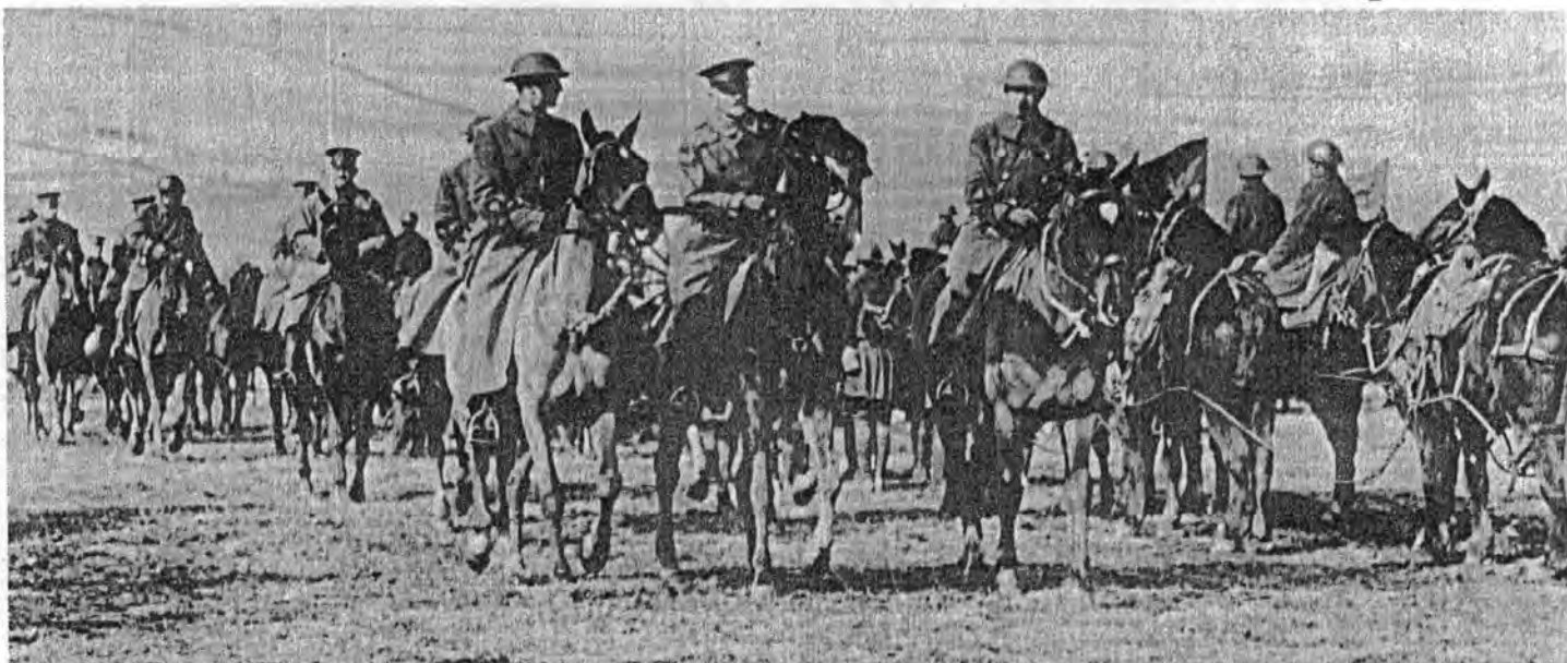
GENERAL JOHN PERSHING INSPECTS 4TH DIVISION ARTILLERY IN GERMANY, MARCH 18, 1919.