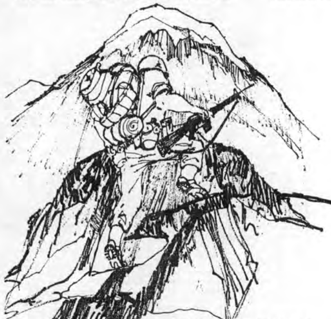
HIGHLANDER EARNS HIS NAME BY SCALING RUGGED TERRAIN.