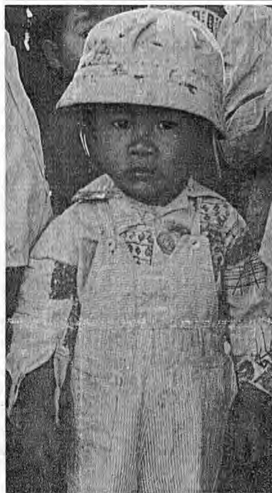
ORPHANED BY WAR, this youngster found his way to the sanctuary of the La Son Orphanage near Camp Enari. Clothes, a school and other facilities have been furnished by Ivymen to help care for the nearly 200 children at La Son.

I feel certain that future chapters of our division's unblemished history will maintain the courage, devotion and dedication to protecting freedom which they have shown in the past.