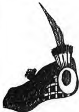
THE SCOTTISH HIGHLANDER TAM IS PROUD SYMBOL.