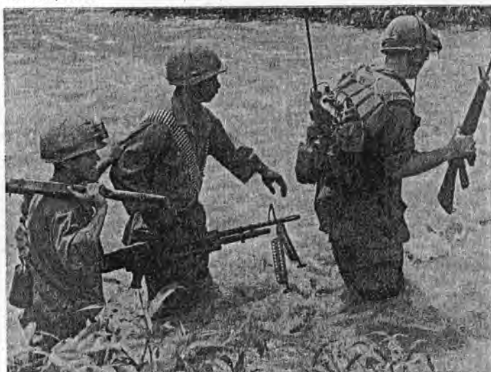
IVYMEN CONTINUE STEADFAST AND LOYAL TRADITION IN VIETNAM.