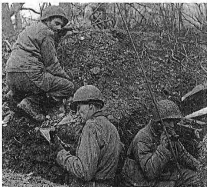
IVYMEN CALL AND CORRECT FIRE MISSIONS IN PRUM VALLEY, GERMANY, MARCH 3, 1945.