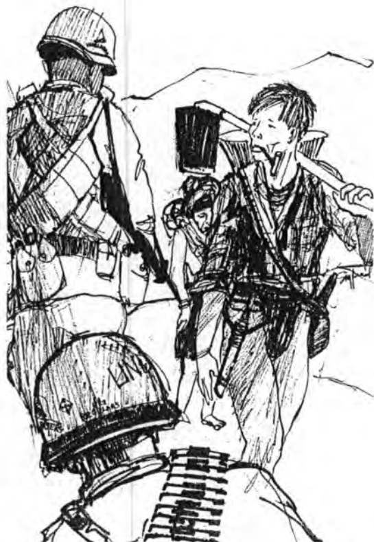
HERITAGE OF HIGHLANDS INSPIRES NICKNAME.