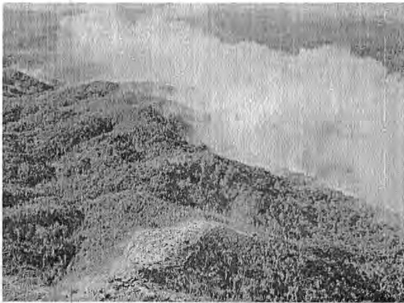
THE BIG CURTAIN—Smoke billows from the mountains as a screen for the evacuation of Firebase 29 near Dak To. The smoke was dropped by Air Force planes to hinder enemy rocket launcher teams shelling the firebase.